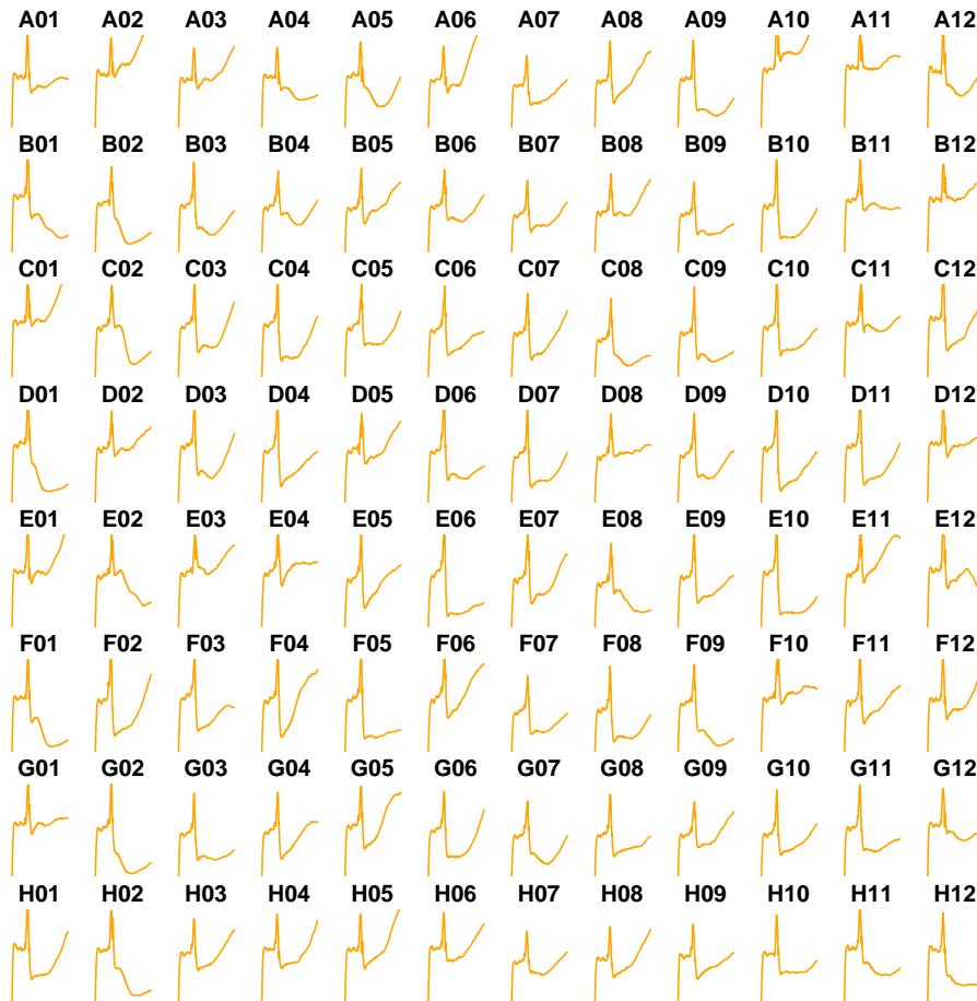
Figure 3: Plate view of a 96-well E-plate from a RTCA assay run.